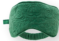
51.530.011 Sleeping Mask One size Velvet Quiltey Days Green 100% Polyester Velvet 1/200