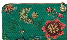
NEW | 51.274.251 Cloe Cosmetic Zipper Pouch 21x3.5x12.5 cm Cece Fiore Green 60% Polyester - 40% PVC Compartment: 1 - Ltr: 0.1 1/64