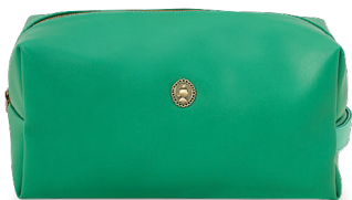
NEW | 51.274.245 Coco Cosmetic Bag Medium 21.5x10x10.5 cm Green 40% PU - 30% PVC - 30% Polyester Compartment: 1 - Pockets: 2 - Ltr: 1.5 1/24