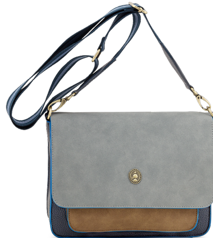
NEW | 51.273.373 Fenna Cross Body Flap Medium 25x7x20 cm Blue 50% PU - 50% Polyester Compartiments: 2 - Pockets: 3 - Ltr: 2 Detachable strap 1/12