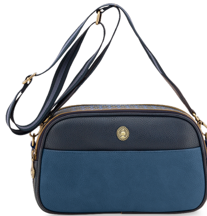
NEW | 51.273.371 Frida Cross Body Bag Medium 26.5x7.5x16.5 cm Blue 40% PU - 30% PVC - 30% Polyester Compartiments: 2 - Pockets: 2 - Ltr: 2.5 Detachable strap 1/16