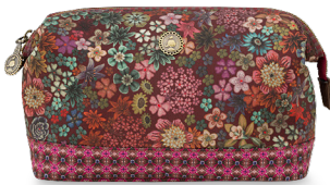
51.274.221 Cosmetic Purse Medium 22.5x9.5x15 cm Tutti i Fiori Pink 60% Polyester - 40% PVC Compartment: 1 - Pockets: 2 - Ltr: 2.3 1/36