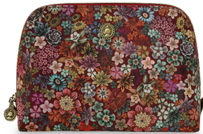
NEW | 51.274.240 Coby Cosmetic Bag Triangle Medium 24/17x8x16.5 cm Tutti i Fiori Pink 60% Polyester - 40% PVC Compartment: 1 - Pockets: 3 - Ltr: 1.2 1/24