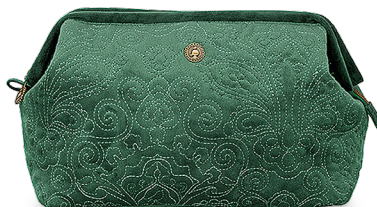
51.274.175 Cosmetic Purse Extra Large 30x13.8x20.7 cm Velvet Quiltey Green 60% Polyester Velvet - 40% PVC Compartment: 1 - Pockets: 3 - Ltr: 6 1/16