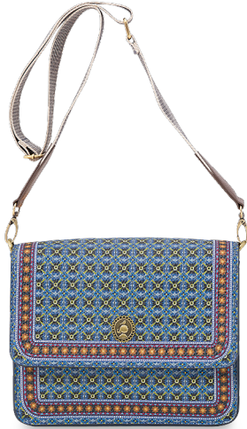
51.273.347 Cross Body Flap Small 19x6x16 cm Clover Blue 60% PVC - 30% Polyester - 10% PU Compartment: 1 - Pockets: 2 - Ltr: 1.3 Detachable strap 1/24