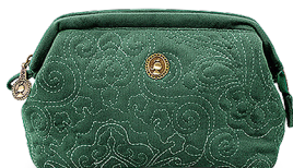
51.274.173 Cosmetic Purse Small 19x8.5x12 cm Velvet Quiltey Green 60% Polyester Velvet - 40% PVC Compartment: 1 - Pockets: 2 - Ltr: 1 1/36