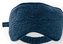
51.530.010 Sleeping Mask One size Velvet Quiltey Days Blue 100% Polyester Velvet 1/200