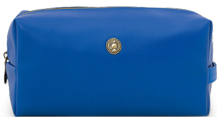
NEW | 51.274.229 Coco Cosmetic Bag Medium 21.5x10x10.5 cm Blue 40% PU - 30% PVC - 30% Polyester Compartment: 1 - Pockets: 2 - Ltr: 1.5 1/24