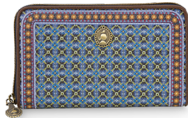
51.273.350 Wallet 18x3x11 cm Clover Blue 60% PVC - 20% PU - 20% Polyester Compartment: 1 - Pockets: 5 Fits 5 cards 1/60