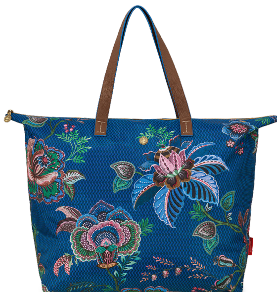
NEW | 51.273.374 Tilda Tote Bag 66x20x44 cm Cece Fiore Blue 60% Polyester - 30% PVC - 10% PU Compartment: 1 - Pockets: 3 - Ltr: 17 1/24