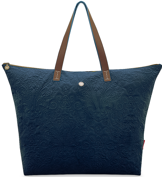
51.273.337 Tote Bag 66x20x44 cm Velvet Quiltey Days Blue 60% Polyester Velvet - 30% PVC - 10% PU Compartment: 1 - Pockets: 3 - Ltr: 17 1/24