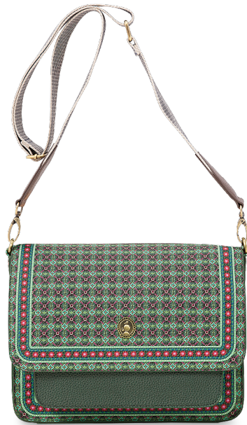
51.273.356 Cross Body Flap 25x7x20 cm Clover Green 60% PVC - 30% Polyester - 10% PU Compartments: 2 - Pockets: 3 - Ltr: 2 Detachable strap 1/12