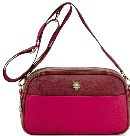
NEW | 51.273.380 Frida Cross Body Bag Medium 26.5x7.5x16.5 cm Red 40% PU - 30% PVC - 30% Polyester Compartment: 2 - Pockets: 2 - Ltr: 2.5 Detachable strap 1/16