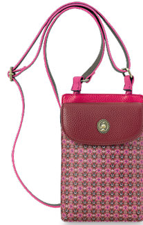
NEW | 51.273.378 Pippa Phone Bag 13.5x3x20 cm Clover Pink 40% PU - 30% PVC - 30% Polyester Compartment: 3 - Pocket: 1 - Ltr: 0.1 Fits 3 cards 1/48