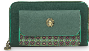
NEW | 51.273.386 Wally Wallet Pocket 19.5x4.5x11 cm Green 40% PU - 30% PVC - 30% Polyester Compartments: 2 - Pockets: 3 Fits 16 cards 1/60