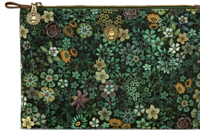
NEW | 51.274.249 Charly Cosmetic Flat Pouch Medium 24x1x15.5 cm Tutti i Fiori Green 60% Polyester - 40% PVC Compartment: 1 - Pocket: 1 - Ltr: 0.3 1/48