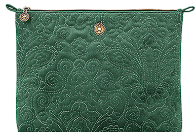
51.274.176 Cosmetic Flat Pouch Large 30x1x22 cm Velvet Quiltey Green 60% Polyester Velvet - 40% PVC Compartment: 1 - Pocket: 1 - Ltr: 0.4 1/60