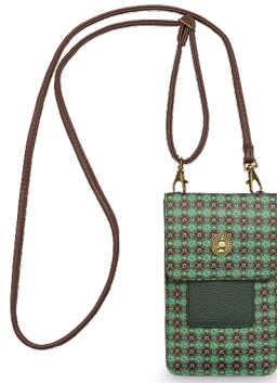
51.273.358 Phone Bag 11x1x18 cm Clover Green 90% PVC - 10% PU Compartment: 1 - Pocket: 1 - Ltr: 0.1 Detachable strap 1/48