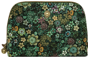
NEW | 51.274.248 Coby Cosmetic Bag Triangle Medium 24/17x8x16.5 cm Tutti i Fiori Green 60% Polyester - 40% PVC Compartment: 1 - Pockets: 3 - Ltr: 1.2 1/24