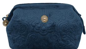
51.274.215 Cosmetic Purse Small 19x8.5x12 cm Velvet Quiltey Days Blue 60% Polyester Velvet - 40% PVC Compartment: 1 - Pockets: 2 - Ltr: 1 1/36