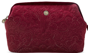
51.274.190 Cosmetic Purse Extra Large 30x13.8x20.7 cm Velvet Quiltey Days Red 60% Polyester Velvet - 40% PVC Compartment: 1 - Pockets: 3 - Ltr: 6 1/16