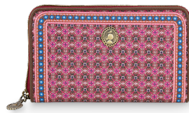
51.273.355 Wallet 18x3x11 cm Clover Pink 60% PVC - 20% PU - 20% Polyester Compartment: 1 - Pockets: 5 Fits 5 cards 1/60