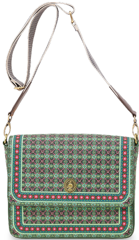
51.273.357 Cross Body Flap Small 19x6x16 cm Clover Green 60% PVC - 30% Polyester - 10% PU Compartment: 1 - Pockets: 2 - Ltr: 1.3 Detachable strap 1/24