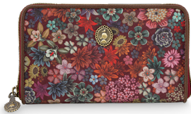
51.273.354 Wallet 18x3x11 cm Tutti i Fiori Pink 50% Polyester - 40% PVC - 10% PU Compartment: 1 - Pockets: 5 Fits 5 cards 1/60