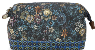
51.274.218 Cosmetic Purse Medium 22.5x9.5x15 cm Tutti i Fiori Blue 60% Polyester - 40% PVC Compartment: 1 - Pockets: 2 - Ltr: 2.3 1/36