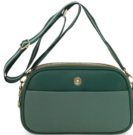
NEW | 51.273.389 Frida Cross Body Bag Medium 26.5x7.5x16.5 cm Green 40% PU - 30% PVC - 30% Polyester Compartments: 2 - Pockets: 2 - Ltr: 2.5 Detachable strap 1/16