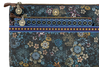
51.274.219 Cosmetic Bag Combi 26x7.5x18 cm/22x1x13 cm Tutti i Fiori Blue 60% Polyester - 40% PVC Compartments: 2 - Pockets: 2 - Ltr: 1.5 1/12