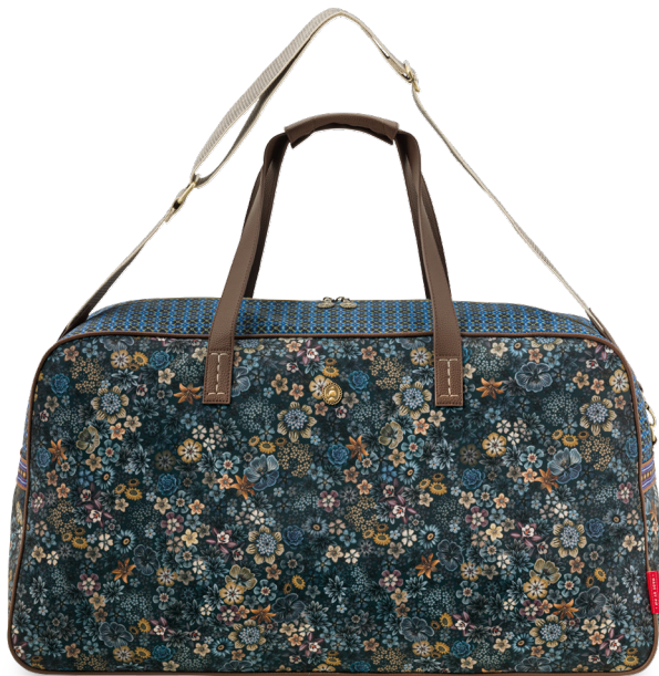
51.273.364 - Weekend Bag Medium 57x22x37 cm - Ltr: 33 NEW | 51.273.375 - Tovy Weekend Bag Large 65x25.5x35 cm - Ltr: 46 Tutti i Fiori Blue 60% Polyester - 30% PVC - 10% PU Compartment: 1 - Pockets: 2 Detachable strap 1/12