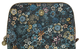
NEW | 51.274.232 Coby Cosmetic Bag Triangle Medium 24/17x8x16.5 cm Tutti i Fiori Blue 60% Polyester - 40% PVC Compartment: 1 - Pockets: 3 - Ltr: 1.2 1/24