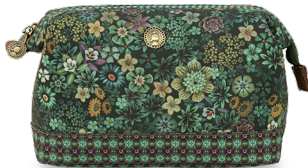
51.274.224 Cosmetic Purse Medium 22.5x9.5x15 cm Tutti i Fiori Green 60% Polyester - 40% PVC Compartment: 1 - Pockets: 2 - Ltr: 2.3 1/36