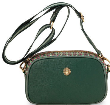
NEW | 51.273.388 Frida Cross Body Bag Small 21x6x13 cm Green 40% PU - 30% PVC - 30% Polyester Compartment: 1 - Pockets: 2 - Ltr: 1.2 Detachable strap 1/24