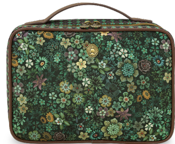
51.274.226 Beauty Case Square Large 27x10x19 cm Tutti i Fiori Green 60% PVC - 40% Polyester Compartments: 2 - Pockets: 2 - Ltr: 4 1/12