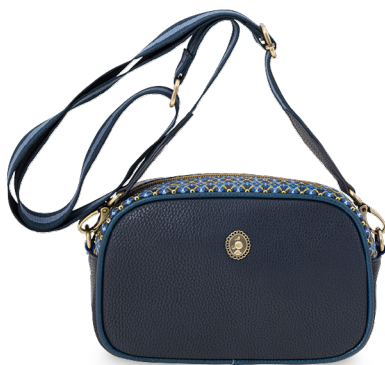
NEW | 51.273.370 Frida Cross Body Bag Small 21x6x13 cm Blue 40% PU - 30% PVC - 30% Polyester Compartment: 1 - Pockets: 2 - Ltr: 1.2 Detachable strap 1/24