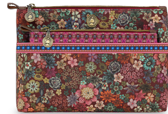
51.274.222 Cosmetic Bag Combi 26x7.5x18 cm/22x1x13 cm Tutti i Fiori Pink 60% Polyester - 40% PVC Compartments: 2 - Pockets: 2 - Ltr: 1.5 1/12