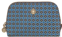
NEW | 51.274.231 Coby Cosmetic Bag Triangle Small 19/15x6x12 cm Clover Blue 60% Polyester - 40% PVC Compartment: 1 - Pockets: 2 - Ltr: 0.5 1/36