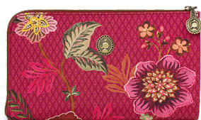
NEW | 51.274.243 Cloe Cosmetic Zipper Pouch 21x3.5x12.5 cm Cece Fiore Red 60% Polyester - 40% PVC Compartment: 1 - Ltr: 0.1 1/64