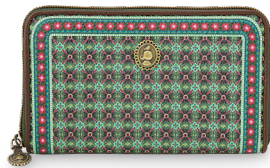
51.273.360 Wallet 18x3x11 cm Clover Green 60% PVC - 20% PU - 20% Polyester Compartment: 1 - Pockets: 5 Fits 5 cards 1/60