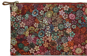
NEW | 51.274.241 Charly Cosmetic Flat Pouch Medium 24x1x15.5 cm Tutti i Fiori Pink 60% Polyester - 40% PVC Compartment: 1 - Pocket: 1 - Ltr: 0.3 1/48