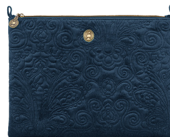
51.274.208 Cosmetic Flat Pouch Large 30x1x22 cm Velvet Quiltey Days Blue 60% Polyester Velvet - 40% PVC Compartment: 1 - Pocket: 1 - Ltr: 0.4 1/60