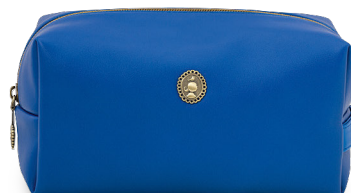
NEW | 51.274.230 Coco Cosmetic Bag Large 26x12x12.6 cm Blue 40% PU - 30% PVC - 30% Polyester Compartment: 1 - Pockets: 2 - Ltr: 3 1/18