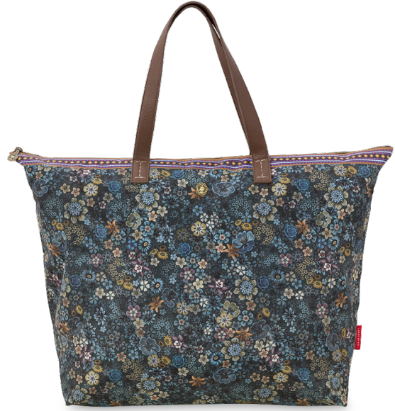
51.273.361 Tote Bag 66x20x44 cm Tutti i Fiori Blue 60% Polyester - 30% PVC - 10% PU Compartment: 1 - Pockets: 3 - Ltr: 17 1/24