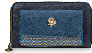
NEW | 51.273.368 Wally Wallet Pocket 19.5x4.5x11 cm Blue 40% PU - 30% PVC - 30% Polyester Compartiments: 2 - Pockets: 3 Fits 16 cards 1/60