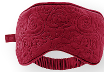
51.530.009 Sleeping Mask One size Velvet Quiltey Days Red 100% Polyester Velvet 1/200