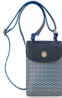
NEW | 51.273.369 Pippa Phone Bag 13.5x3x20 cm Clover Blue 40% PU - 30% PVC - 30% Polyester Compartiments: 3 - Pocket: 1 - Ltr: 0.1 Fits 3 cards 1/48