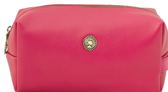
NEW | 51.274.238 Coco Cosmetic Bag Large 26x12x12.6 cm Pink 40% PU - 30% PVC - 30% Polyester Compartment: 1 - Pockets: 2 - Ltr: 3 1/18