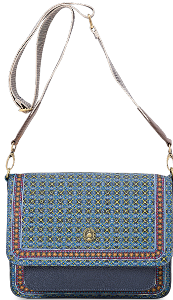
51.273.346 Cross Body Flap 25x7x20 cm Clover Blue 60% PVC - 30% Polyester - 10% PU Compartiments: 2 - Pockets: 3 - Ltr: 2 Detachable strap 1/12