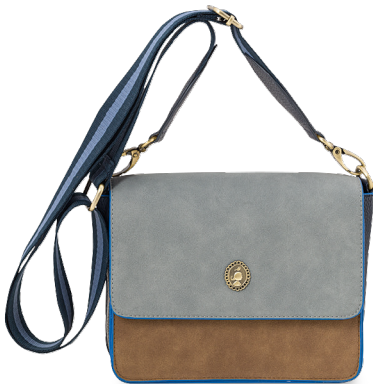
NEW | 51.273.372 Fenna Cross Body Flap Small 19x6x16 cm Blue 50% PU - 50% Polyester Compartment: 1 - Pockets: 2 - Ltr: 1.3 Detachable strap 1/24