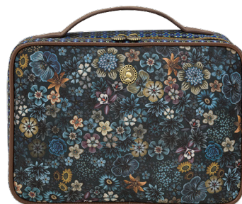
51.274.220 Beauty Case Square Large 27x10x19 cm Tutti i Fiori Blue 60% PVC - 40% Polyester Compartments: 2 - Pockets: 2 - Ltr: 4 1/12