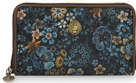
51.273.349 Wallet 18x3x11 cm Tutti i Fiori Blue 50% Polyester - 40% PVC - 10% PU Compartment: 1 - Pockets: 5 Fits 5 cards 1/60