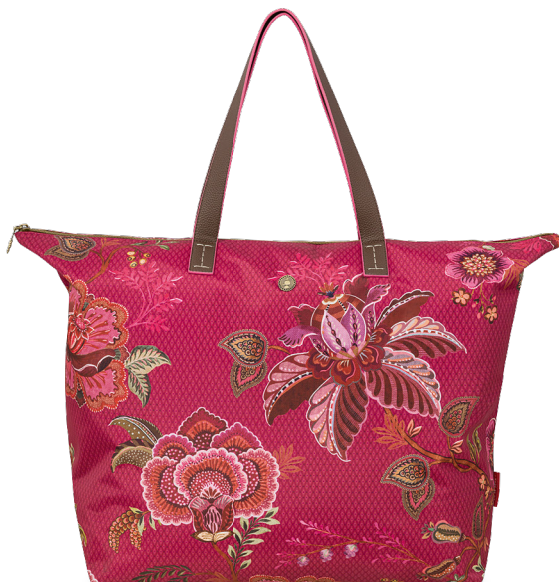
NEW | 51.273.383 Tilda Tote Bag 66x20x44 cm Cece Fiore Red 60% Polyester - 30% PVC - 10% PU Compartment: 1 - Pockets: 3 - Ltr: 17 1/24