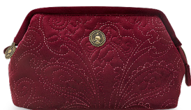
51.274.188 Cosmetic Purse Small 19x8.5x12 cm Velvet Quiltey Days Red 60% Polyester Velvet - 40% PVC Compartment: 1 - Pockets: 2 - Ltr: 1 1/36