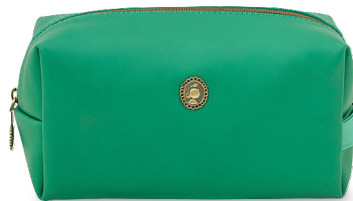
NEW | 51.274.246 Coco Cosmetic Bag Large 26x12x12.6 cm Green 40% PU - 30% PVC - 30% Polyester Compartment: 1 - Pockets: 2 - Ltr: 3 1/18