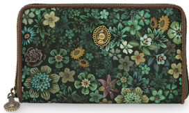
51.273.359 Wallet 18x3x11 cm Tutti i Fiori Green 50% Polyester - 40% PVC - 10% PU Compartment: 1 - Pockets: 5 Fits 5 cards 1/60