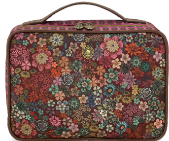
51.274.223 Beauty Case Square Large 27x10x19 cm Tutti i Fiori Pink 60% PVC - 40% Polyester Compartments: 2 - Pockets: 2 - Ltr: 4 1/12