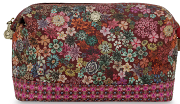
NEW | 51.274.242 Cooper Cosmetic Purse Large 26x12x18 cm Tutti i Fiori Pink 60% Polyester - 40% PVC Compartment: 1 - Pockets: 3 - Ltr: 4 1/24