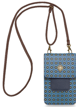
51.273.348 Phone Bag 11x1x18 cm Clover Blue 90% PVC - 10% PU Compartment: 1 - Pocket: 1 - Ltr: 0.1 Detachable strap 1/48