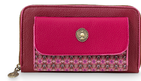
NEW | 51.273.377 Wally Wallet Pocket 19.5x4.5x11 cm Red 40% PU - 30% PVC - 30% Polyester Compartment: 2 - Pockets: 3 Fits 16 cards 1/60