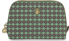
NEW | 51.274.247 Coby Cosmetic Bag Triangle Small 19/15x6x12 cm Clover Green 60% Polyester - 40% PVC Compartment: 1 - Pockets: 2 - Ltr: 0.5 1/36