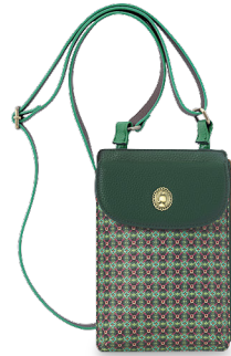
NEW | 51.273.387 Pippa Phone Bag 13.5x3x20 cm Clover Green 40% PU - 30% PVC - 30% Polyester Compartments: 3 - Pocket: 1 - Ltr: 0.1 Fits 3 cards 1/48