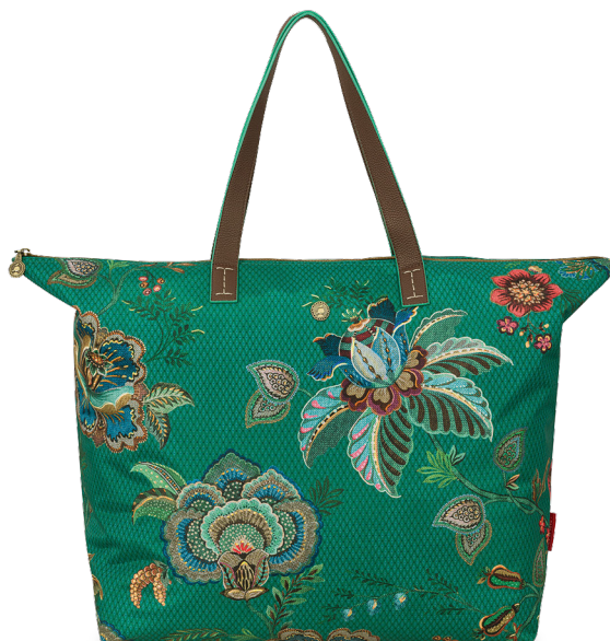
NEW | 51.273.392 Tilda Tote Bag 66x20x44 cm Cece Fiore Green 60% Polyester - 30% PVC - 10% PU Compartment: 1 - Pockets: 3 - Ltr: 17 1/24