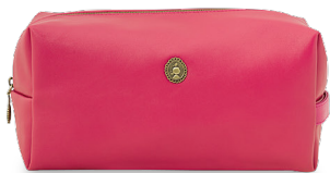
NEW | 51.274.237 Coco Cosmetic Bag Medium 21.5x10x10.5 cm Pink 40% PU - 30% PVC - 30% Polyester Compartment: 1 - Pockets: 2 - Ltr: 1.5 1/24