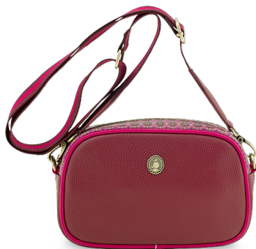
NEW | 51.273.379 Frida Cross Body Bag Small 21x6x13 cm Red 40% PU - 30% PVC - 30% Polyester Compartment: 1 - Pockets: 2 - Ltr: 1.2 Detachable strap 1/24