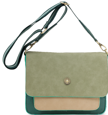
NEW | 51.273.391 Fenna Cross Body Flap Medium 25x7x20 cm Green 50% PU - 50% Polyester Compartments: 2 - Pockets: 3 - Ltr: 2 Detachable strap 1/12