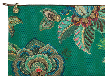
NEW | 51.274.252 Charly Cosmetic Flat Pouch Large 30x1x22 cm Cece Fiore Green 60% Polyester - 40% PVC Compartment: 1 - Pocket: 1 - Ltr: 0.4 1/60