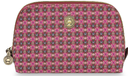
NEW | 51.274.239 Coby Cosmetic Bag Triangle Small 19/15x6x12 cm Clover Pink 60% Polyester - 40% PVC Compartment: 1 - Pockets: 2 - Ltr: 0.5 1/36