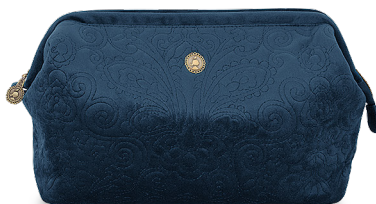
51.274.217 Cosmetic Purse Extra Large 30x13.8x20.7 cm Velvet Quiltey Days Blue 60% Polyester Velvet - 40% PVC Compartment: 1 - Pockets: 3 - Ltr: 6 1/16