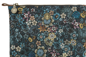
NEW | 51.274.233 Charly Cosmetic Flat Pouch Medium 24x1x15.5 cm Tutti i Fiori Blue 60% Polyester - 40% PVC Compartment: 1 - Pocket: 1 - Ltr: 0.3 1/48