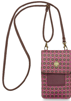
51.273.353 Phone Bag 11x1x18 cm Clover Pink 90% PVC - 10% PU Compartment: 1 - Pocket: 1 - Ltr: 0.1 Detachable strap 1/48