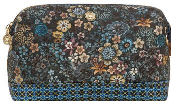
NEW | 51.274.234 Cooper Cosmetic Purse Large 26x12x18 cm Tutti i Fiori Blue 60% Polyester - 40% PVC Compartment: 1 - Pockets: 3 - Ltr: 4 1/24