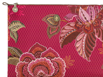
NEW | 51.274.244 Charly Cosmetic Flat Pouch Large 30x1x22 cm Cece Fiore Red 60% Polyester - 40% PVC Compartment: 1 - Pocket: 1 - Ltr: 0.4 1/60