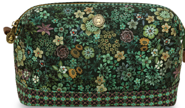
NEW | 51.274.250 Cooper Cosmetic Purse Large 26x12x18 cm Tutti i Fiori Green 60% Polyester - 40% PVC Compartment: 1 - Pockets: 3 - Ltr: 4 1/24