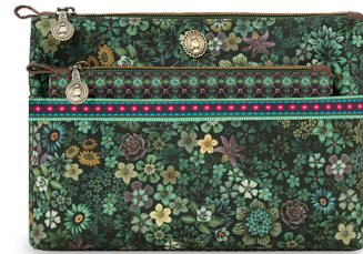
51.274.225 Cosmetic Bag Combi 26x7.5x18 cm/22x1x13 cm Tutti i Fiori Green 60% Polyester - 40% PVC Compartments: 2 - Pockets: 2 - Ltr: 1.5 1/12