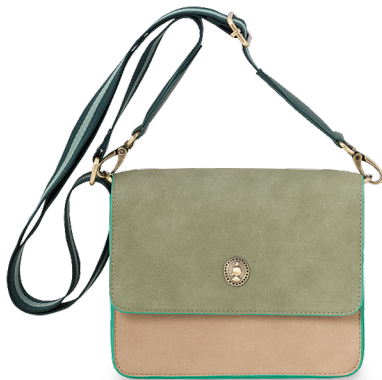
NEW | 51.273.390 Fenna Cross Body Flap Small 19x6x16 cm Green 50% PU - 50% Polyester Compartment: 1 - Pockets: 2 - Ltr: 1.3 Detachable strap 1/24