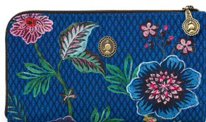
NEW | 51.274.235 Cloe Cosmetic Zipper Pouch 21x3.5x12.5 cm Cece Fiore Blue 60% Polyester - 40% PVC Compartment: 1 - Ltr: 0.1 1/64