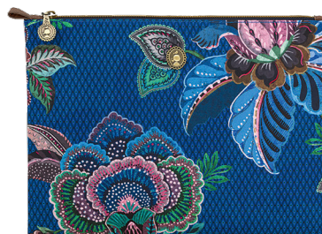
NEW | 51.274.236 Charly Cosmetic Flat Pouch Large 30x1x22 cm Cece Fiore Blue 60% Polyester - 40% PVC Compartment: 1 - Pocket: 1 - Ltr: 0.4 1/60