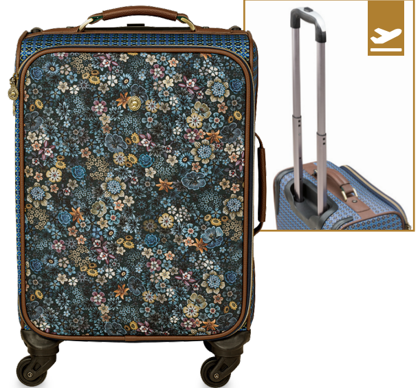
NEW | 51.273.376 Tosca Trolley 35x22x47 cm Tutti i Fiori Blue 60% Polyester - 30% PVC - 10% PU Compartment: 1 - Pockets: 3 - Ltr: 24 1/1 - Cabin Size Spinner